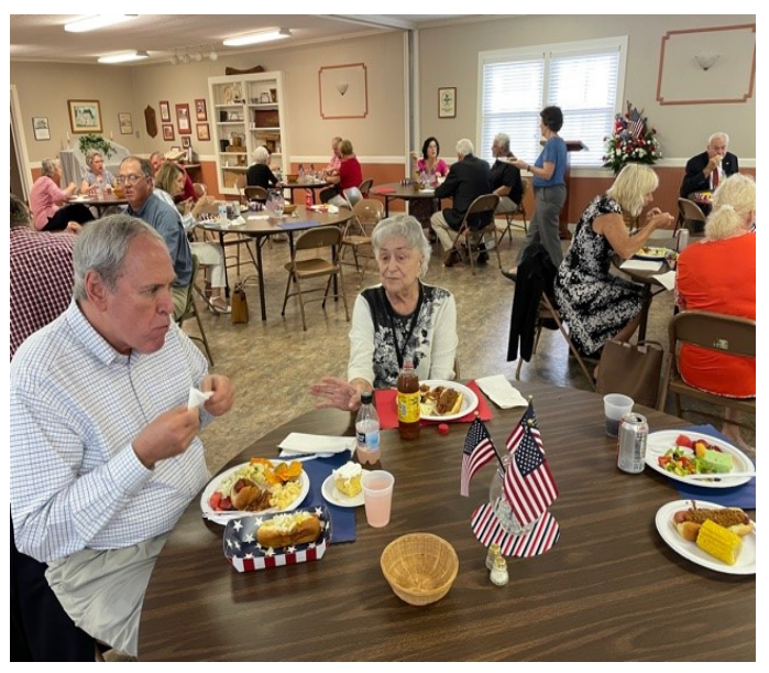
Good Food and Good Fellowship at Our Congregational Dinner on July 11th