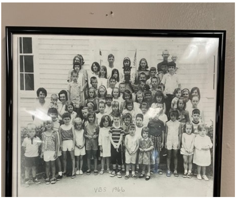
VBS 1966-Who Can You Name?