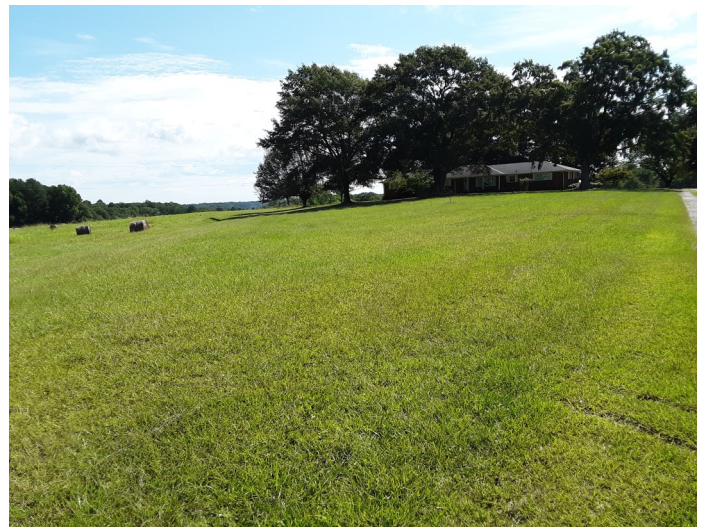
Let's Enjoy Them While We Can