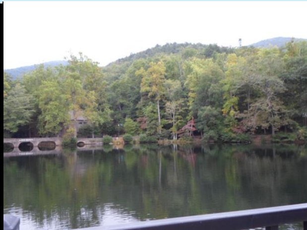
Montreat Conference Center, Montreat, NC Lake Susan