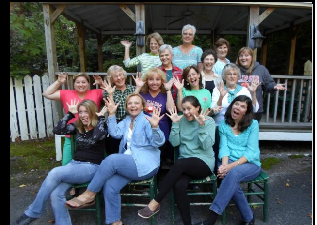
Were they flippy when they got there...or just after spending the weekend together???