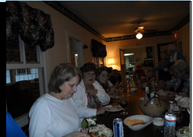
Enjoying the fellowship of sharing a meal prepared together.