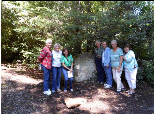
A walk in the woods helps our dinner digest.