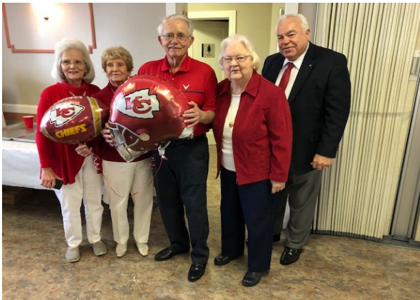
Going with a Winner 2020