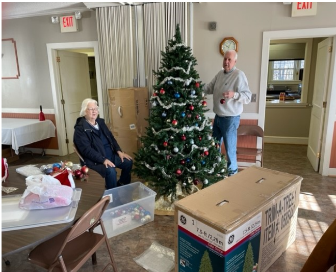
What goes up must come down...