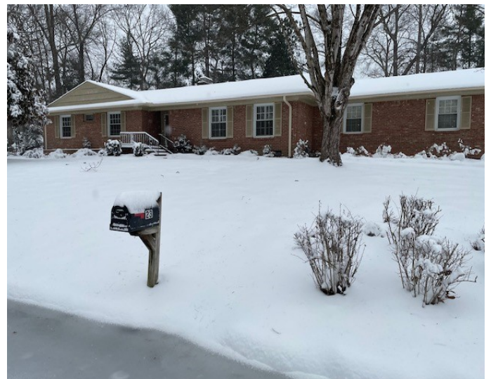
“Neither snow nor rain...”