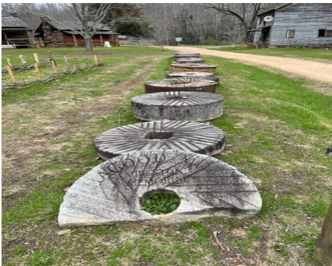
Hagood Grist Mill