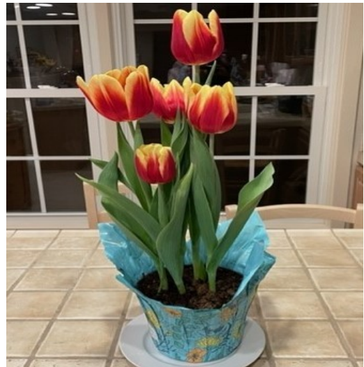
Get Well Tulips for Hazel