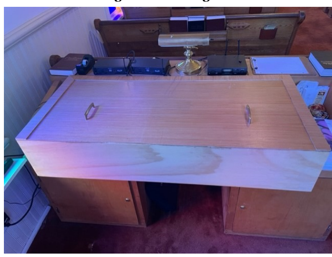
Thanks to Jacky Stamps for making the new Soundboard Case