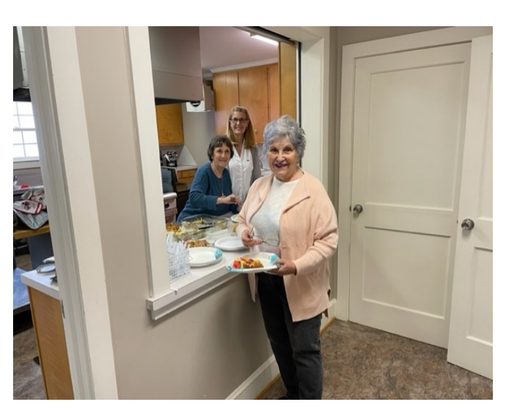
Happy Kitchen Crew