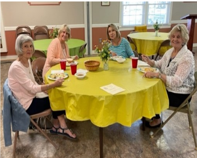
"The Four Sisters"