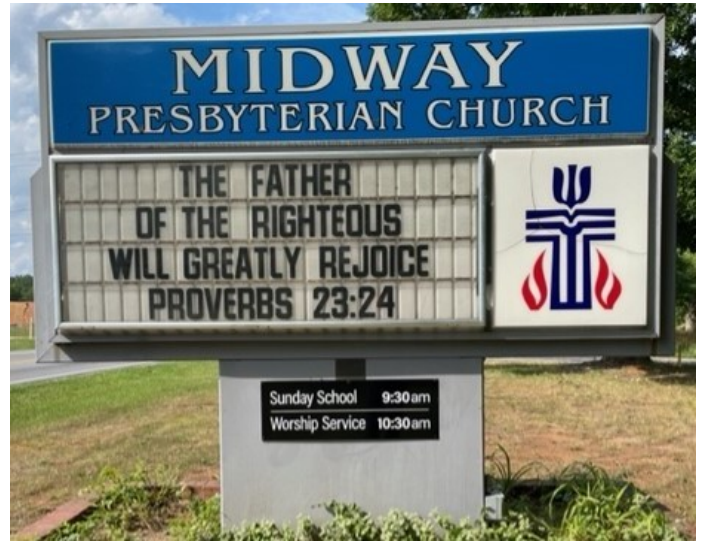
Sunday Schedule added to Church Sign Thanks to Jacky Stamps