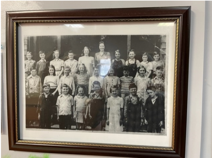
Can You Name Any Students at Hammond School?