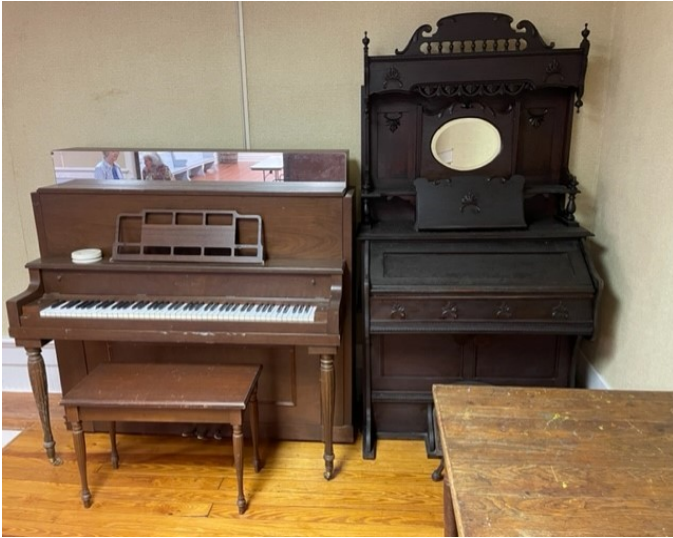
The Organ at Hammond Community Center Was Once at Midway Church