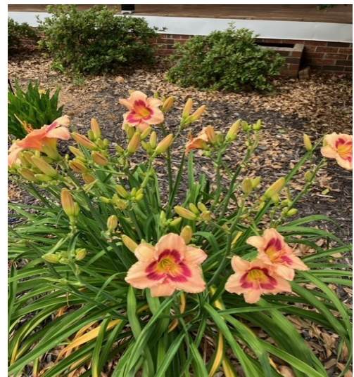
Tom & Terry's Day Lilies