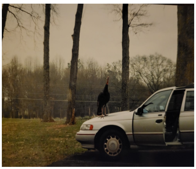
Turkey visiting Midway in 1998