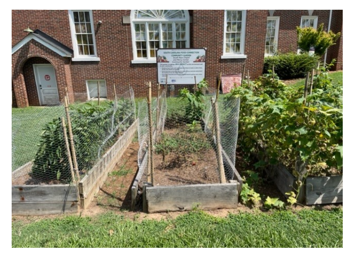
Community Garden @S. Main St. Chapel & Mercy Center