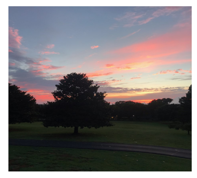
God's Beautiful Sunset over LeNelle's House