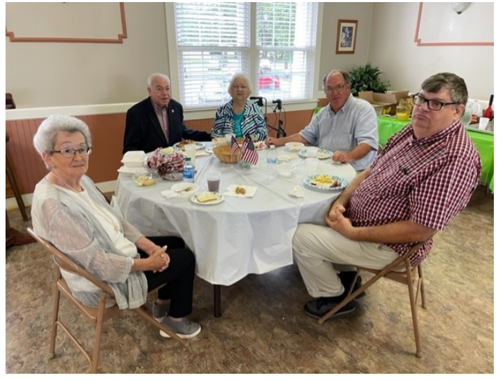
"Just Like Old Times"