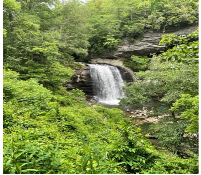
Looking Glass Falls near Brevard, NC