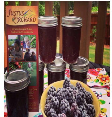
Join the Daytrippers on a trip to Justus Apple Orchard- near Hendersonville, NC Thursday, September 15.