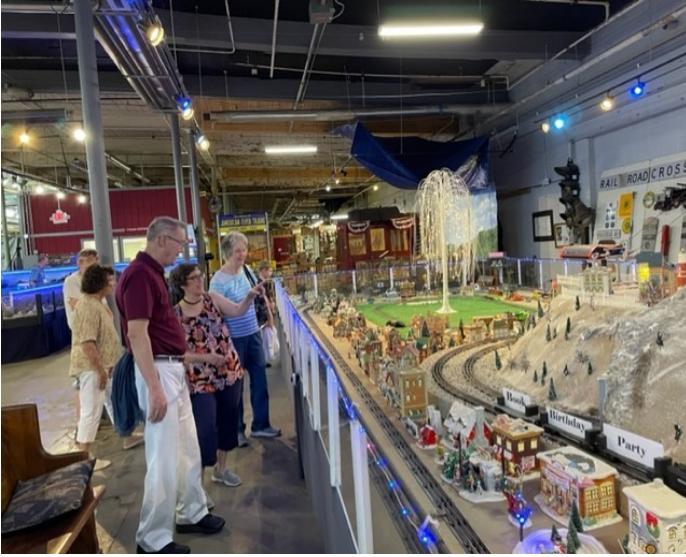
“See That, Jim”