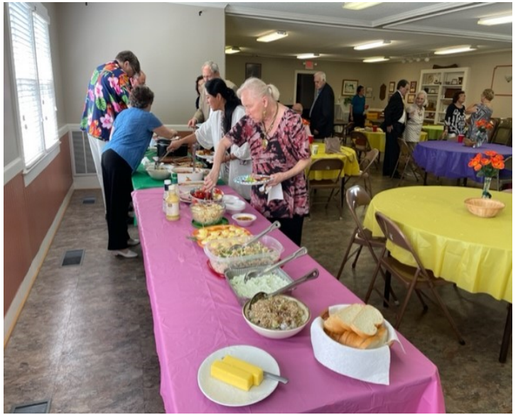
A Gracious Plenty