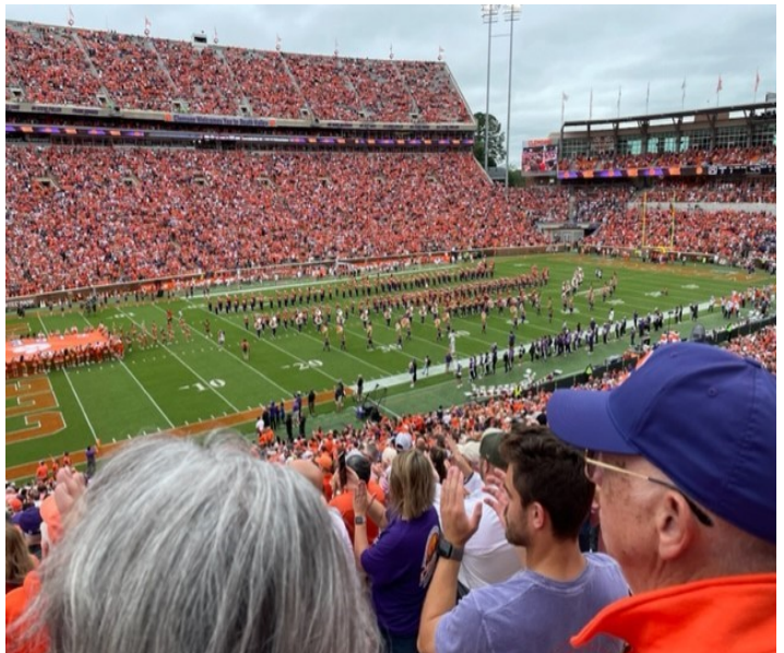
“All Work & No Play...”