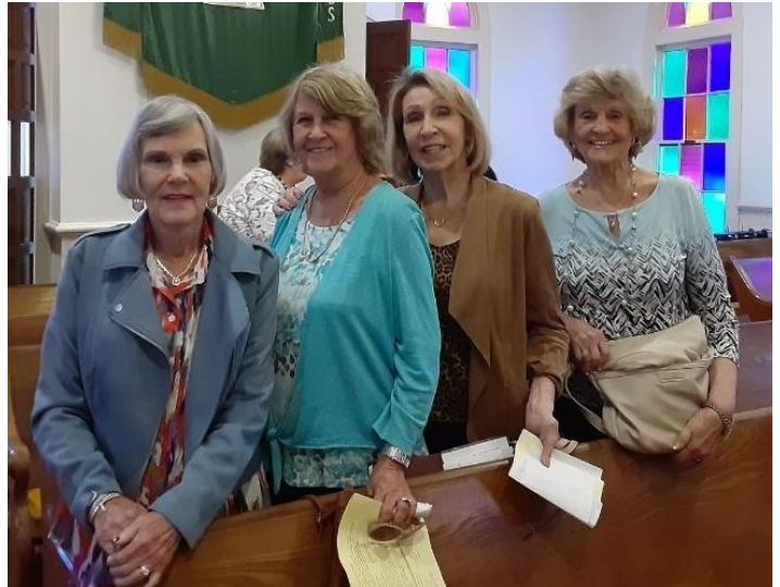
“The Four Sisters”