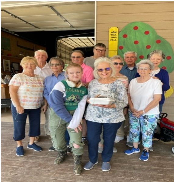
Happy Daytrippers @Justus Orchard