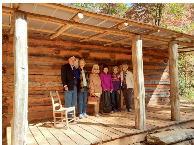
Part of our Group in front of the Itinerary Preacher's House at Hagood Mill