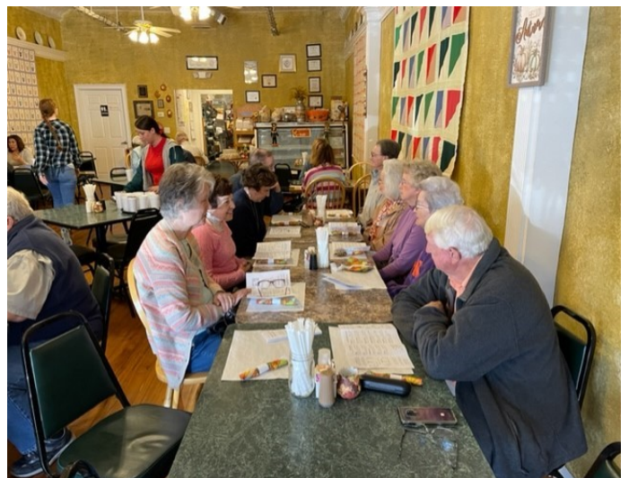
Hungry Daytrippers at the Little Bistro in Liberty