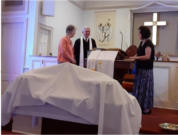
Pastor Appreciation Sunday