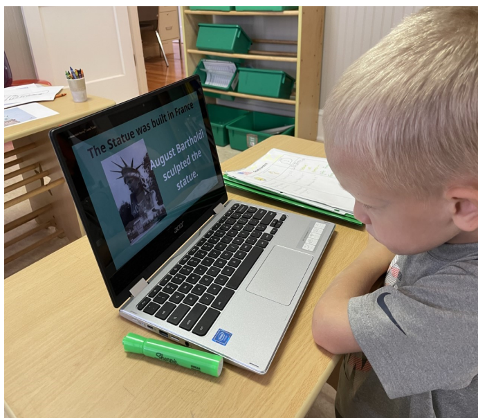
Coen learns who built the Statue of Liberty and where it was built

Please keep the UHH students and teachers in your prayers for a safe and productive school year.