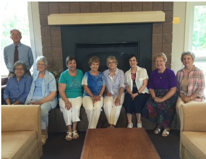
Parish Care Team 2016 Rose Dining Hall