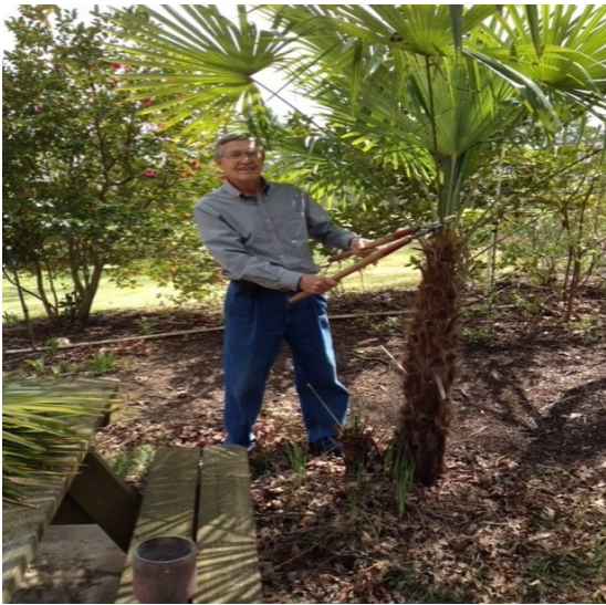
Getting Ready for Palm Sunday