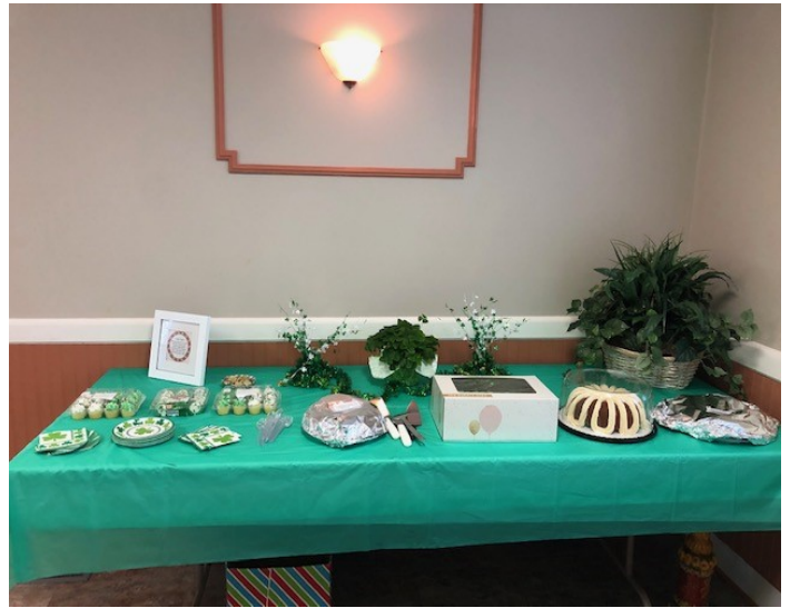
Irish Dessert Table