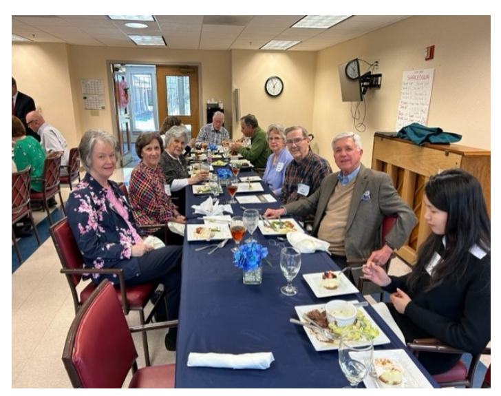
Ambassadors Enjoy Lunch @Foothills Presbyterian Community