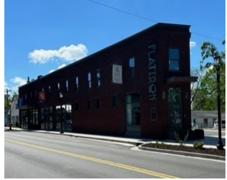
Greenville's Flatiron Building @1211 Pendleton Street