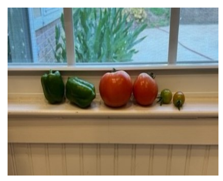
John's Early Produce