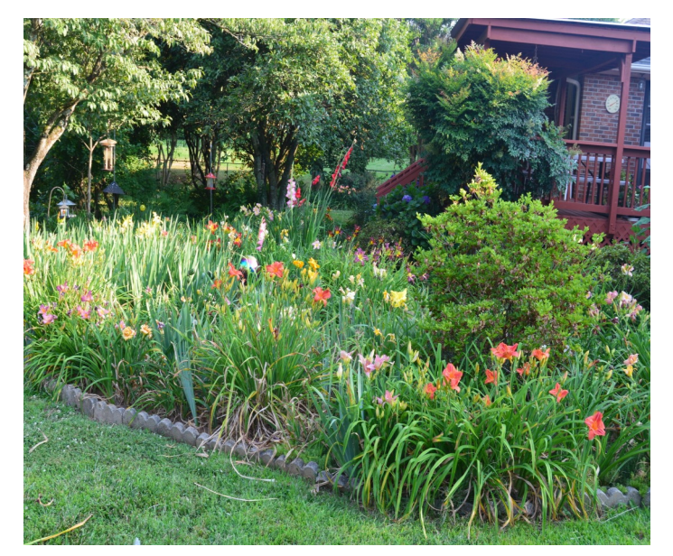
Anna May Potter's Beautiful Garden