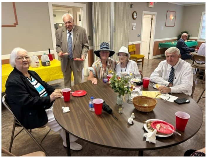
"If the Hat Fits, Wear It"