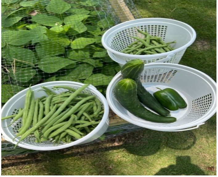
The Dodwell's "First Picking"