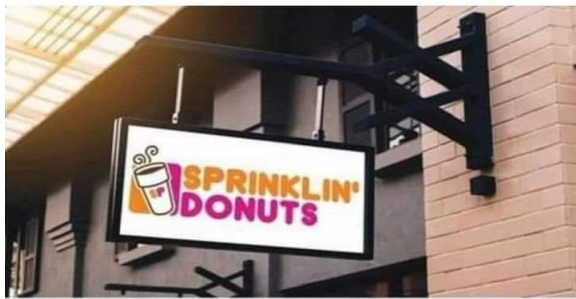
Dunkin' Donuts Opens New Sprinklin' Donuts For Presbyterians

Our Jar Offering for the month of August will go to Family Promise. This organization provides emergency shelter and transitional housing for homeless families with children in Anderson County.