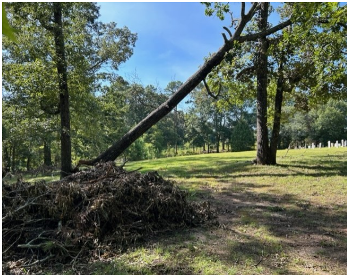
Trees felled in Storm