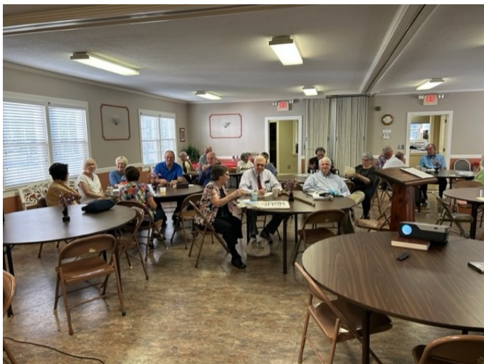
Five Wishes Workshop