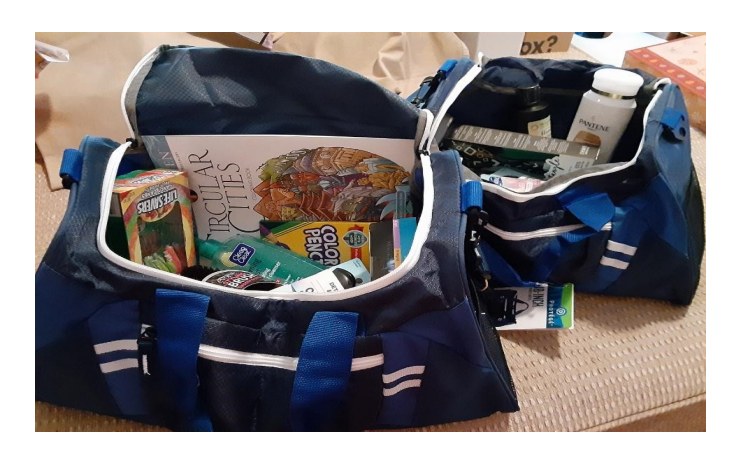
$258 for toys and clothing for our adopted youngster, 7 -vear-old Eli, at Calvary Home: