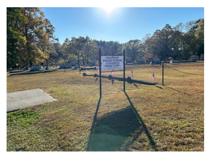
Our thanks to Keith and Bob Wentzky for placing the flags in the cemetery for Veteran's Day

You are invited to bring canned and boxed food items, toiletries, and warm clothing (hats, gloves, scarfs, socks, etc.) for the Salvation Army.