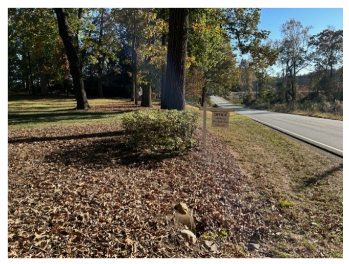
Thanks to Keith Wentzky for making the view safer to exit from the church office parking lot