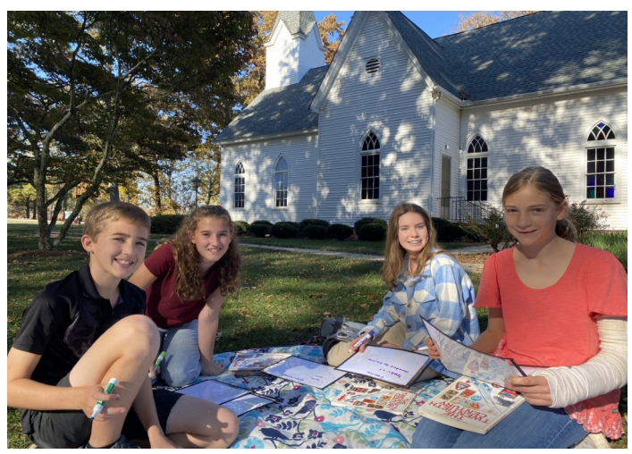
Legacy Academy Students Studying Outside