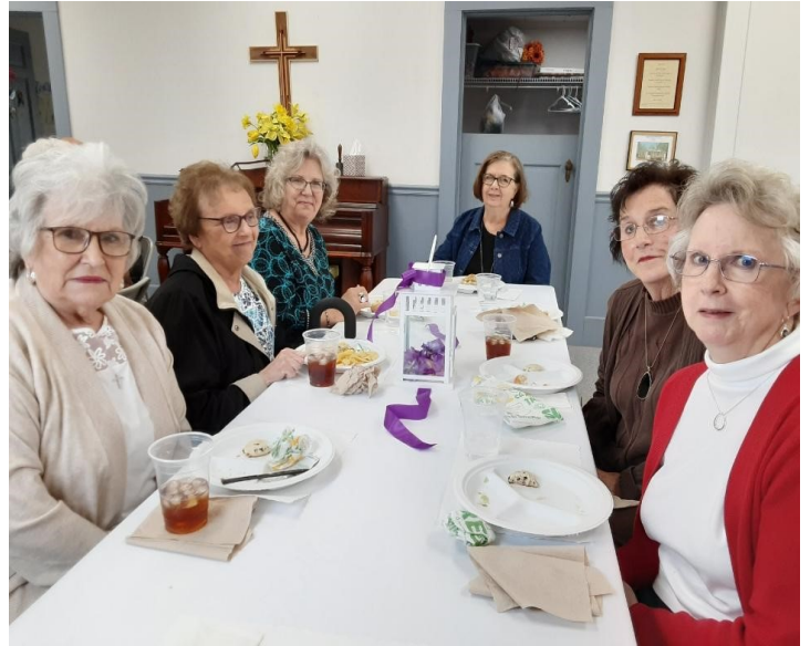
Daffodils and Irises in Bloom