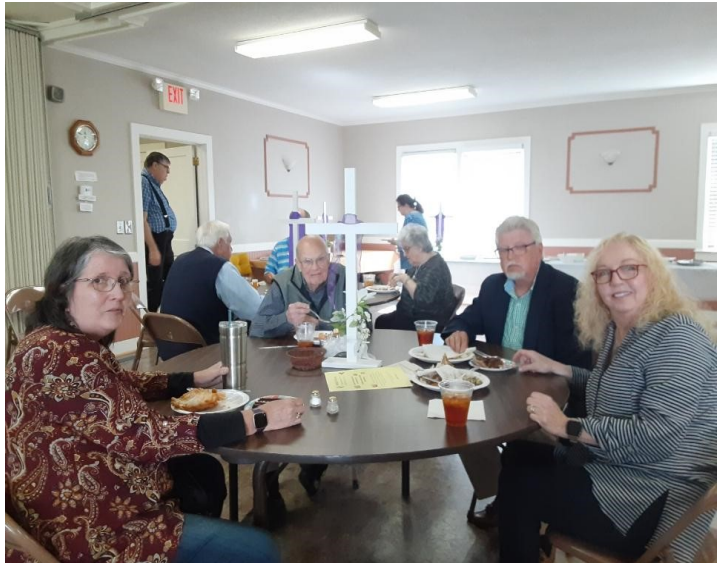
28 Members and Guests enjoyed our 2nd Sunday Lunch on April 14 and supported Meals on Wheels with the 2-Cents-a-Meal Offering.