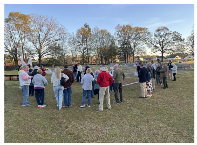
Easter Sunrise Service