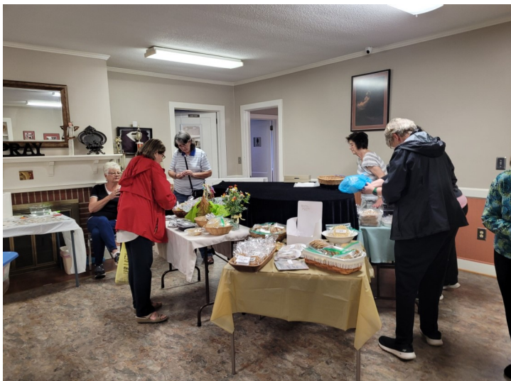
The Bake Sale was a success at the Spring Festival