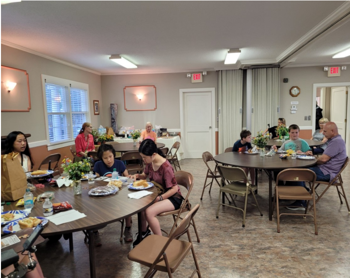
Members & Friends enjoying lunch @spring Festival