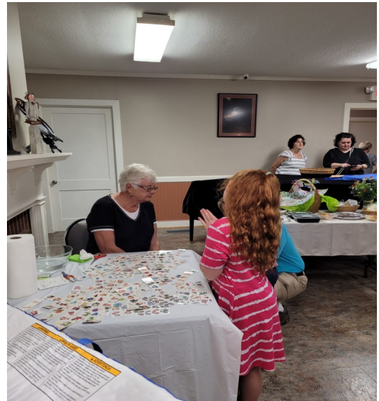
SDonetta at Tattoo table @Spring Festival