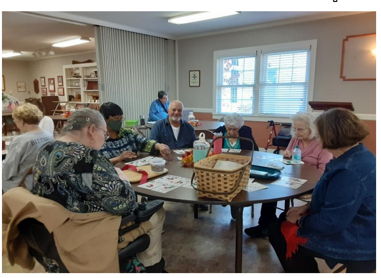
Bingo November 13, 2024