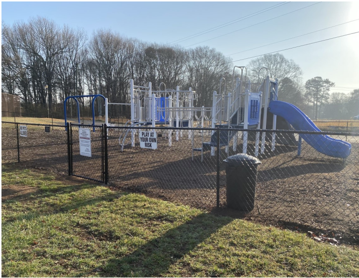
Playground & Tennis court fences repaired