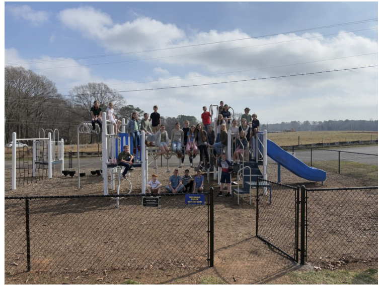
Legacy Academy Students "Happy Together Again"