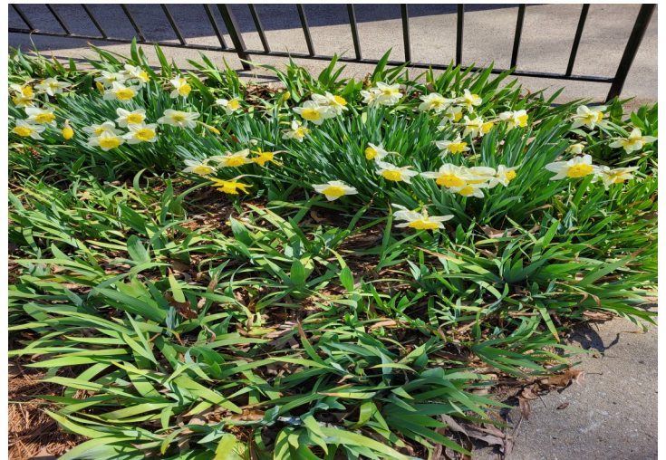
Spring has arrived!