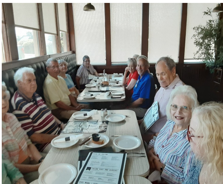
We had sixteen to join the Lunch Bunch for food and fellowship at Dolce Vita on May 22