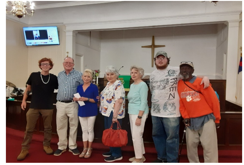
Worshiping with S. Main Street Chapel & and delivering Jar Offering & and Budgeted Benevolence check