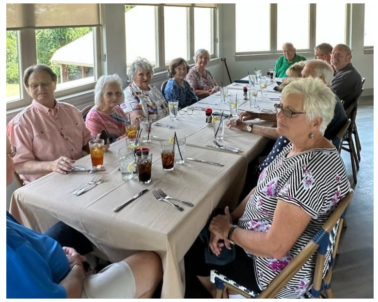
The Lunch Bunch at the Lighthouse Restaurant in Seneca June 19, 2025