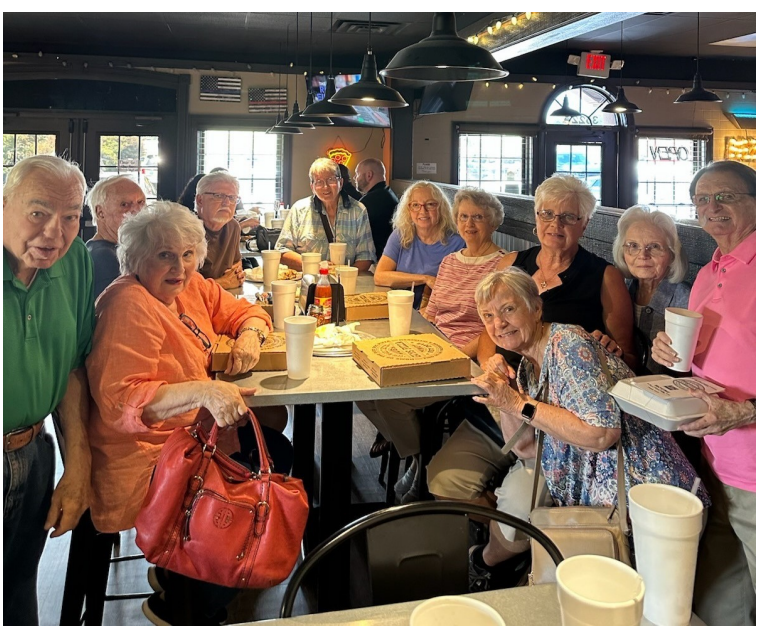
The Lunch Bunch at Guy's Pizza July 17, 2025