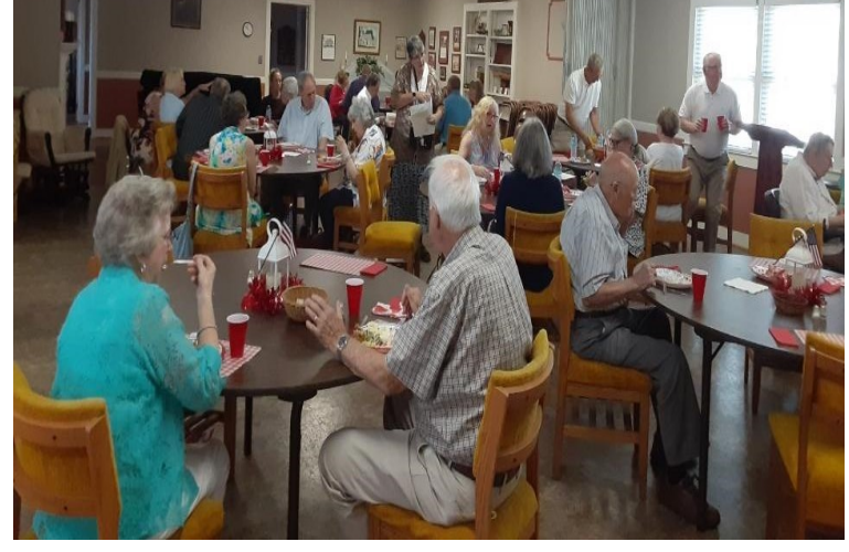
Second Sunday Dinner July 13, 2025