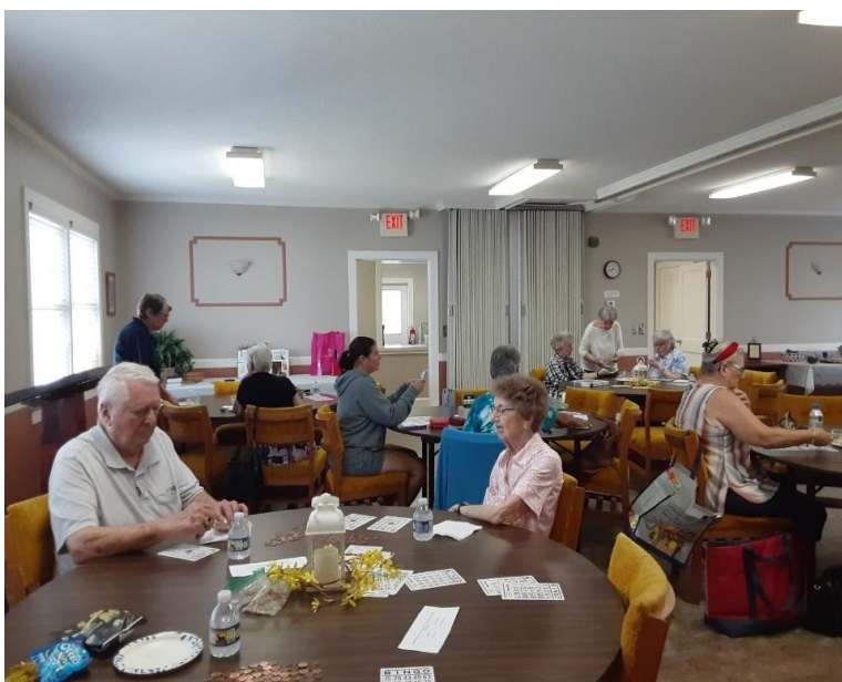
We had 18 members and guests at Bingo August 20